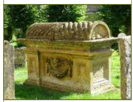
Bale tomb at Burford

Historically, churchyards were enclosed with fences and walls to keep out animals or if the church kept grazing animals, to keep them in! Some fences in the diocese are fantastic survivals dating back hundreds of years and thus are considered to be greatly significant. Works to fences and rails are treated the same as walls in terms of faculty