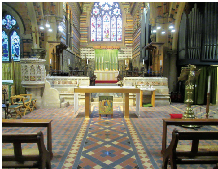
All Saint's Church, Boyne Hill, in Maidenhead looks its best after £275,000 was raised to re-lay and restore 18,000 floor tiles. This has opened up opportunities for using the church building in new ways for ministry and outreach.