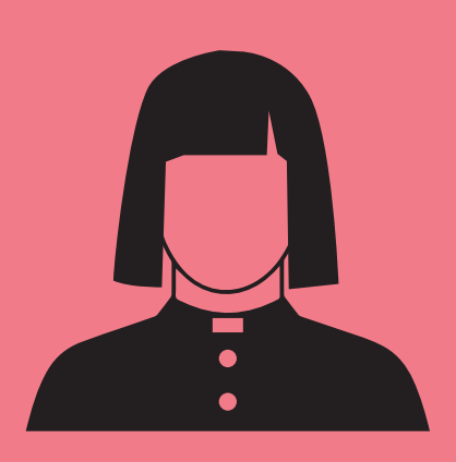
House for duty clergy