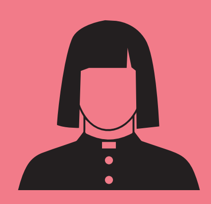
Self supporting and licensed lay ministry (SSM and LLM)