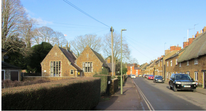
Church Street, Bodicote