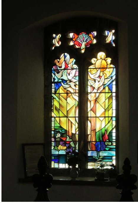
The South Window