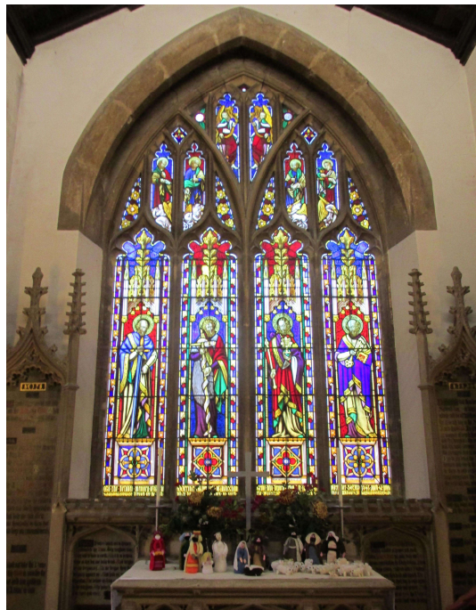
The East Window

Further alterations and amendments to the Church fabric have continued throughout the years, including relatively recent repairs to the beautiful stained glass East Window. Today, St. John the Baptist Church stands as a Grade II* listed building, with a capacity of approximately 200. The tower has a ring of eight bells and an iron-framed turret clock.