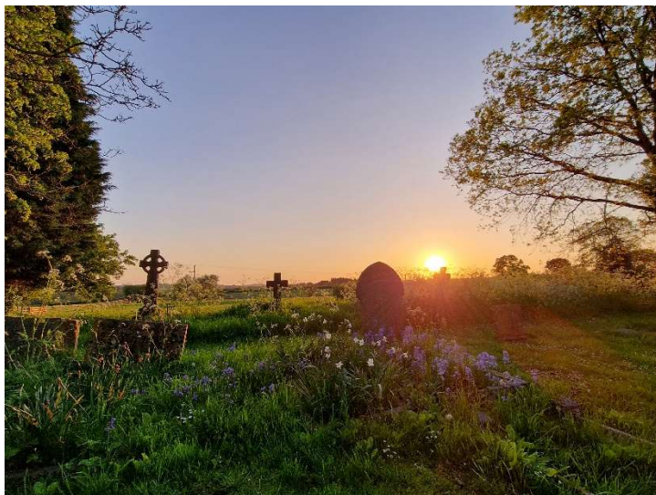
Sunset from the churchyard