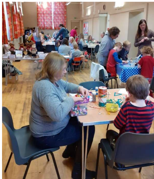
The Christmas craft session