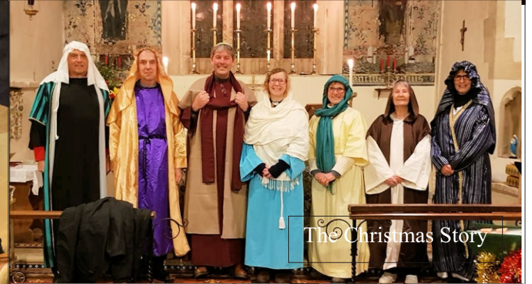
The Christmas Story