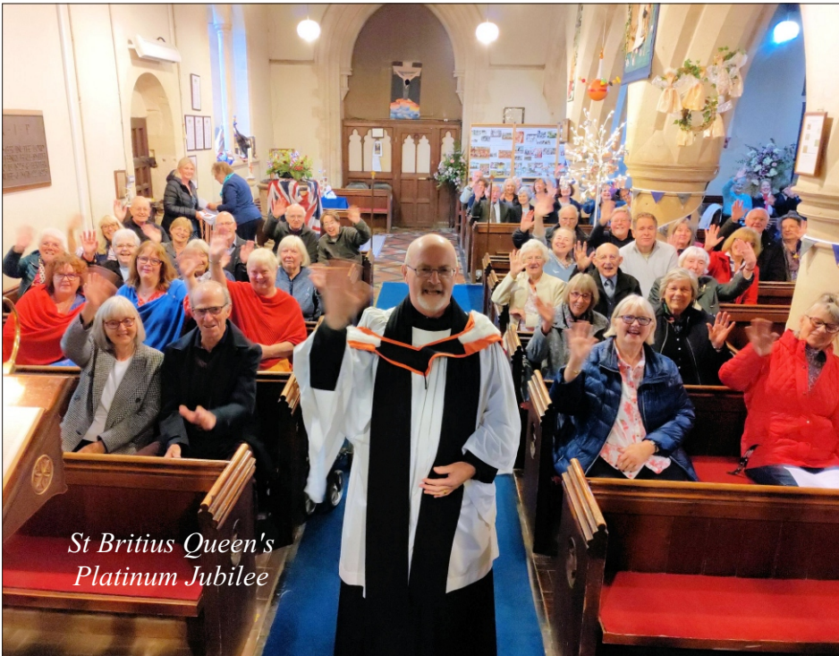
St Britius Queen's Platinum Jubilee