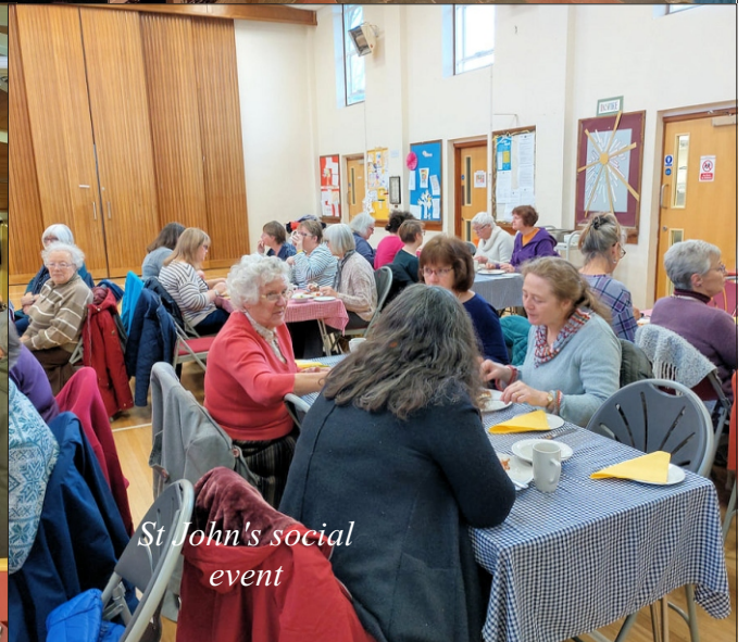
St John's social event