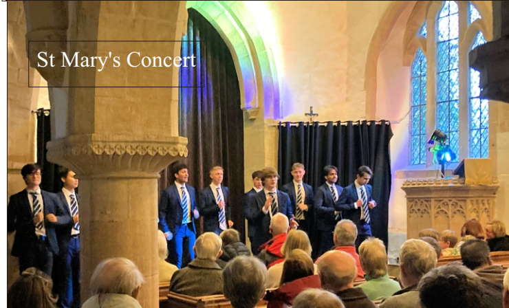
St Mary's Concert