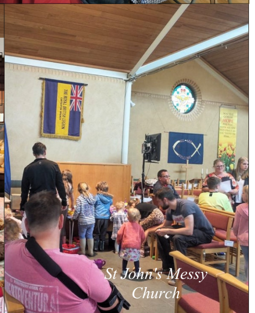
St John's Messy Church