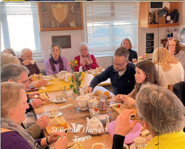
St Britius Harvest Tea