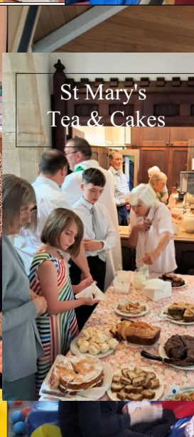
St Mary's Tea & Cakes