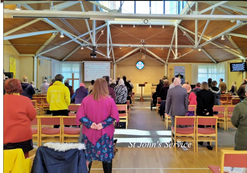
St John's Service