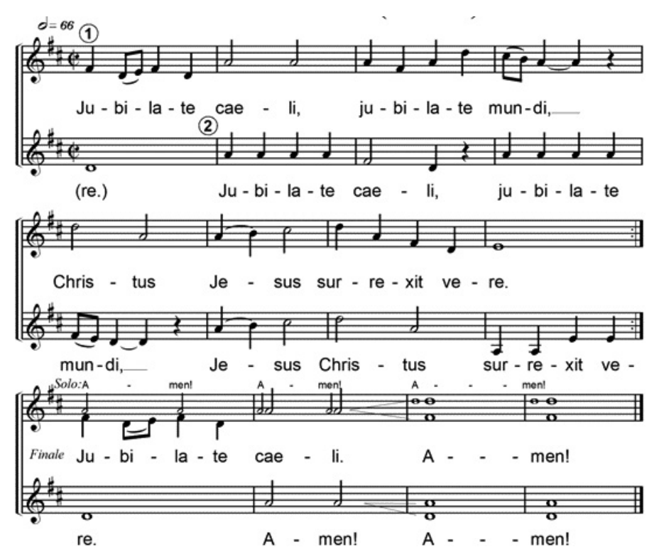
Psalm 18: 1-6, 17-20