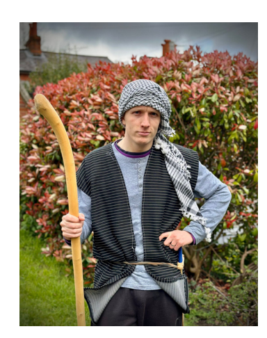
In character as a Temple guard for an interactive retelling of the Easter story for families

Thank you for reading, if you have any questions, do get in touch at the above email address.