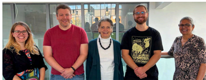
The GWPC Prayer Ministry team

We believe prayer shapes us, drawing us closer to God and enabling us to share the gospel with our community. It is woven into our services through confession and intercession, and we are seeking to deepen our life of prayer together as a church. We do this by offering seasonal resources (such as for Lent and Advent), regular prayer meetings before our Sunday services, and times of shared prayer in our Life Groups. Our hope is that prayer will continue to grow at the heart of who we are and how we live out our faith.