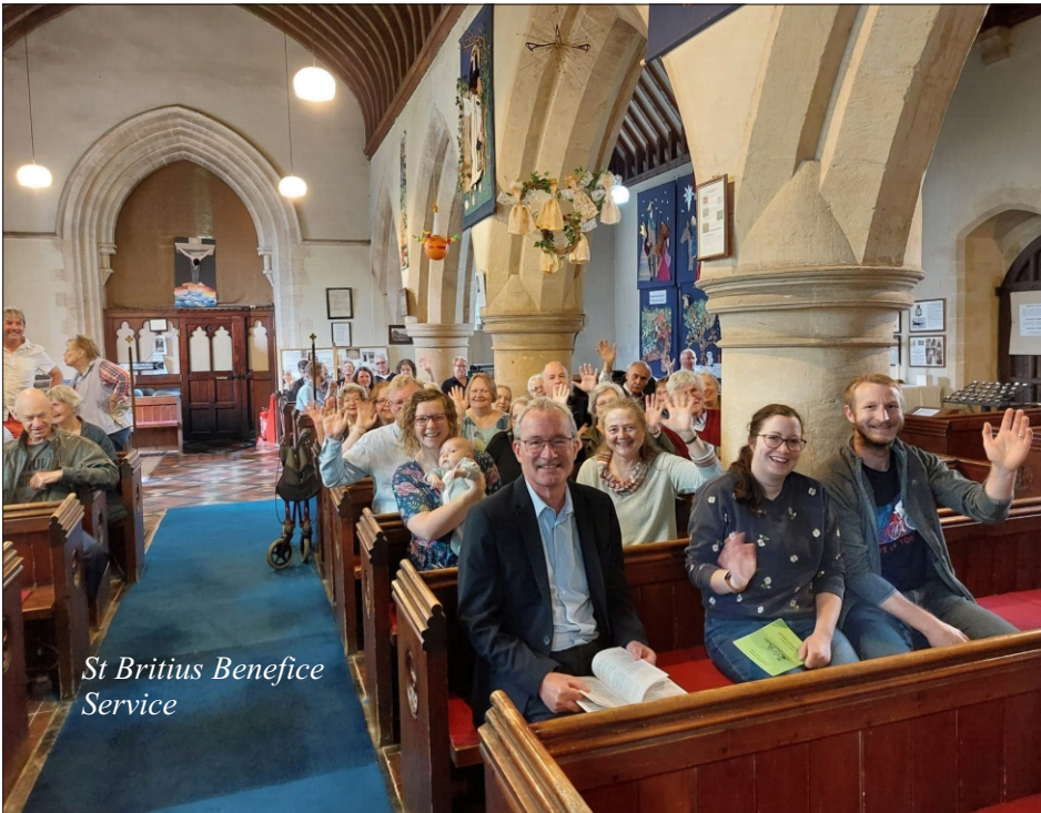
St Britius Benefice Service