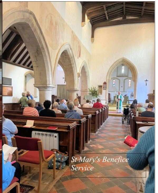
St Mary's Benefice Service