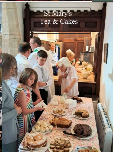
St Mary's Tea & Cakes