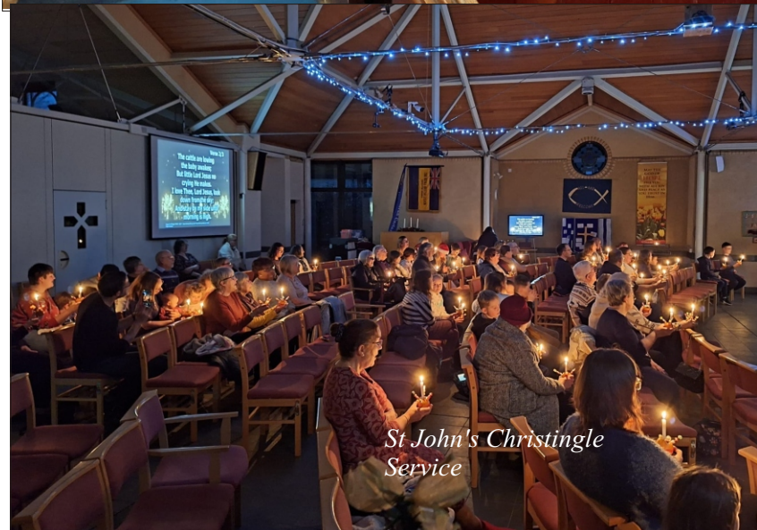
St John's Christingle Service