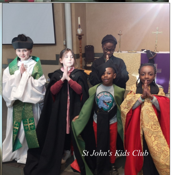
St John's Kids Club