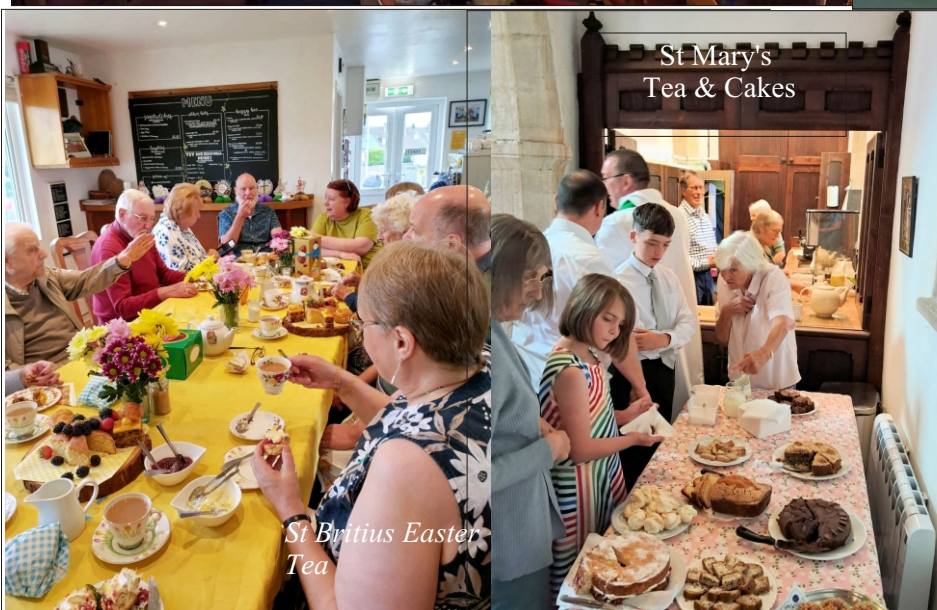
St Britius Easter Tea