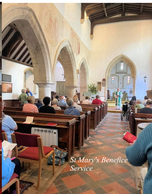
St Mary's Benefice Service