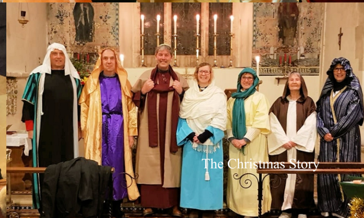
The Christmas Story