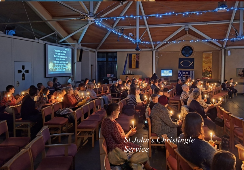
St John's Christingle Service