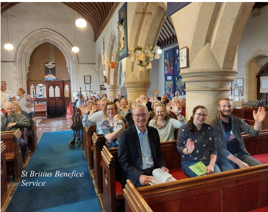
St Britius Benefice Service