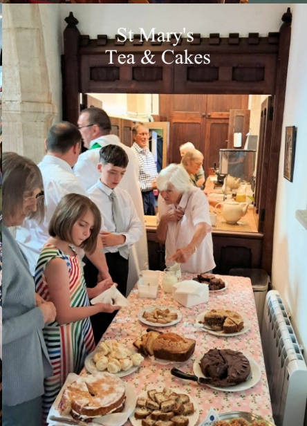
St Mary's Tea & Cakes