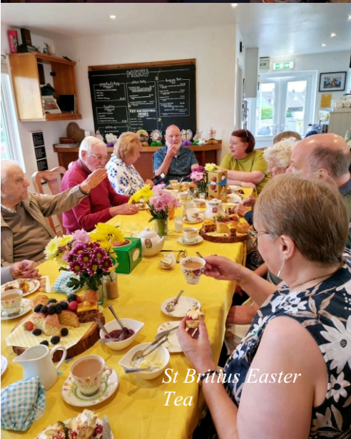
St Britius Easter Tea