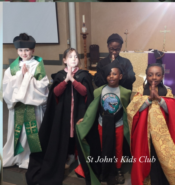
St John's Kids Club