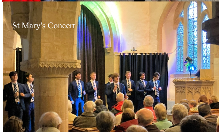
St Mary's Concert