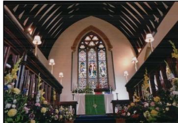
St Mary Magdalene Shippon